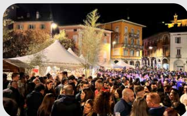
SAGRA DEL BORGO