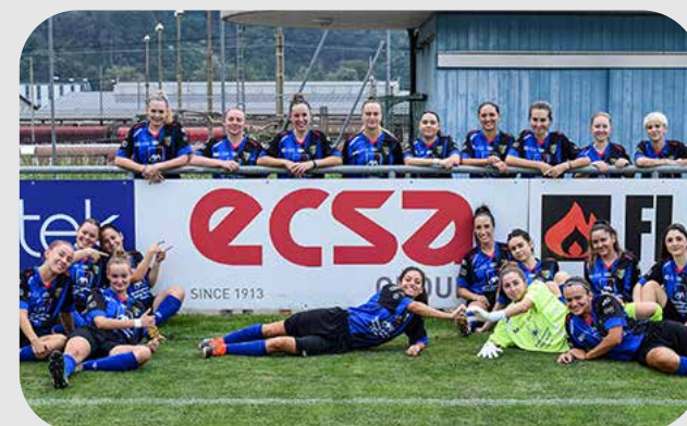
SC BALERNA FEMMINILE