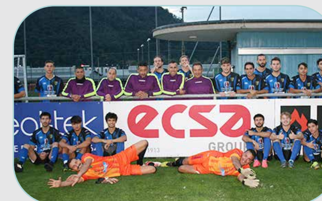
SC BALERNA MASCHILE