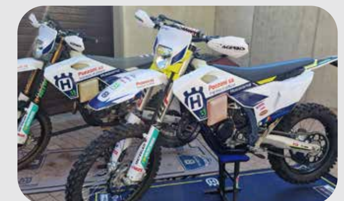
FIM INTERNATIONAL SIX DAYS OF ENDURO (ISDE)