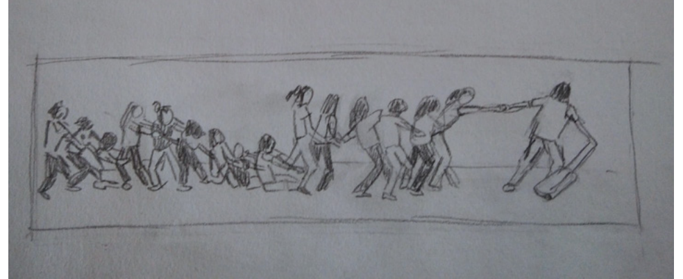
production of the reference photo