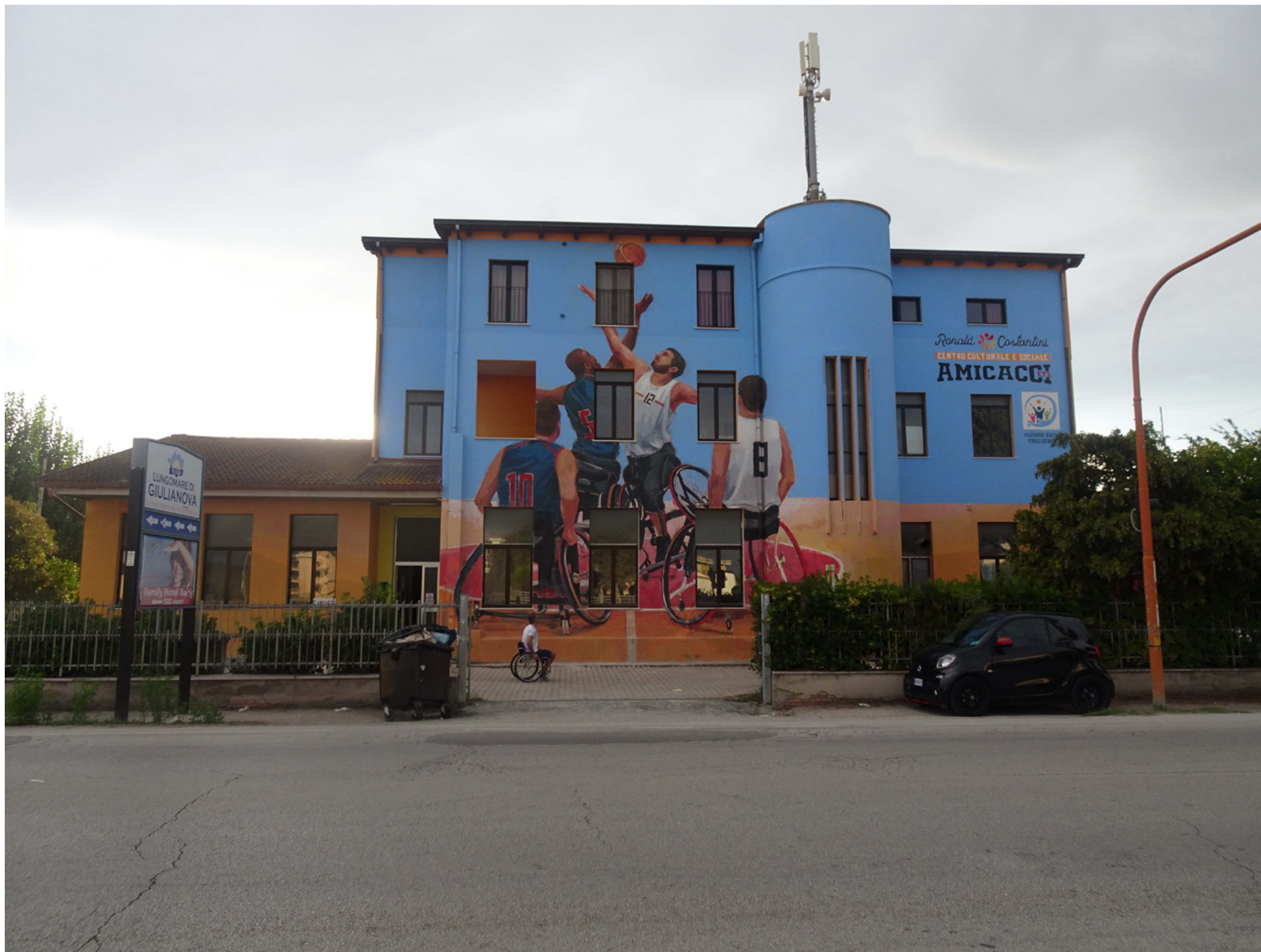
PALLA CONTESA , Giulianova (TE), Italy, 2021.