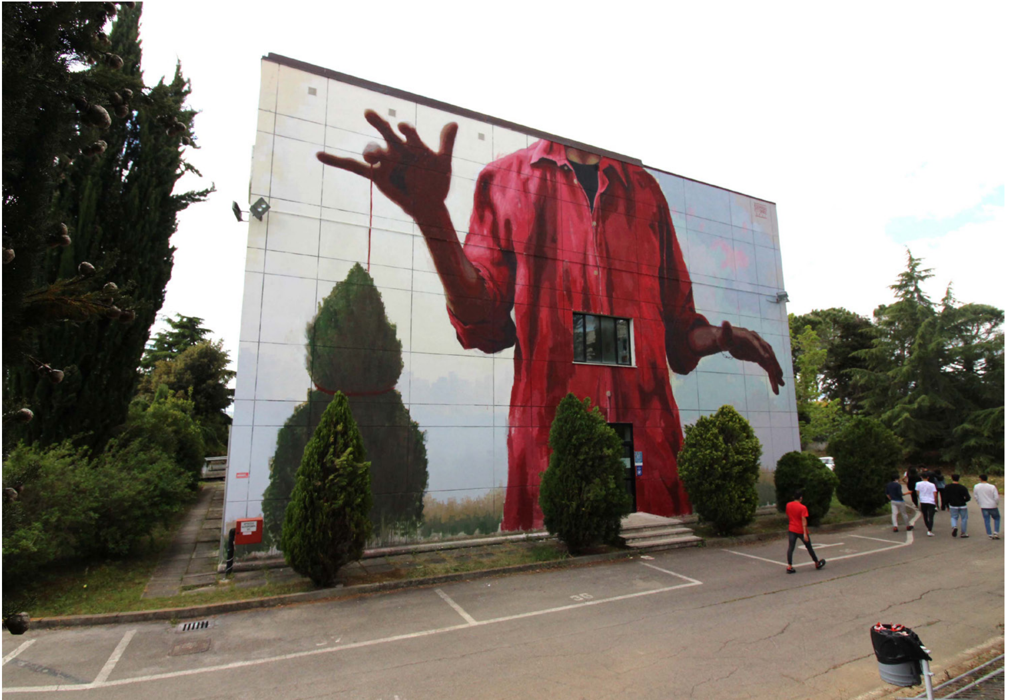
ARB-HOMINES , Giulianova (TE), Italy, 2021.