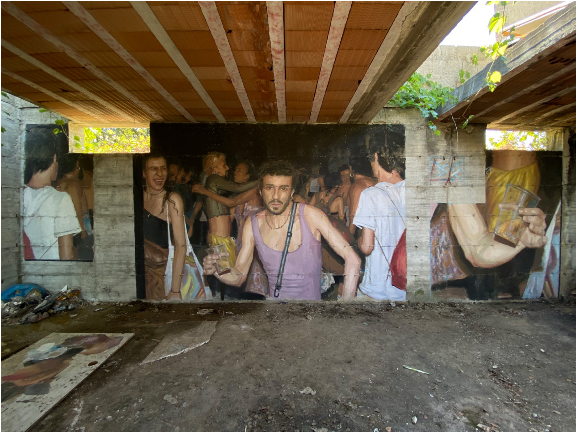
PRIDE , Montone (TE), Italy, 2022.