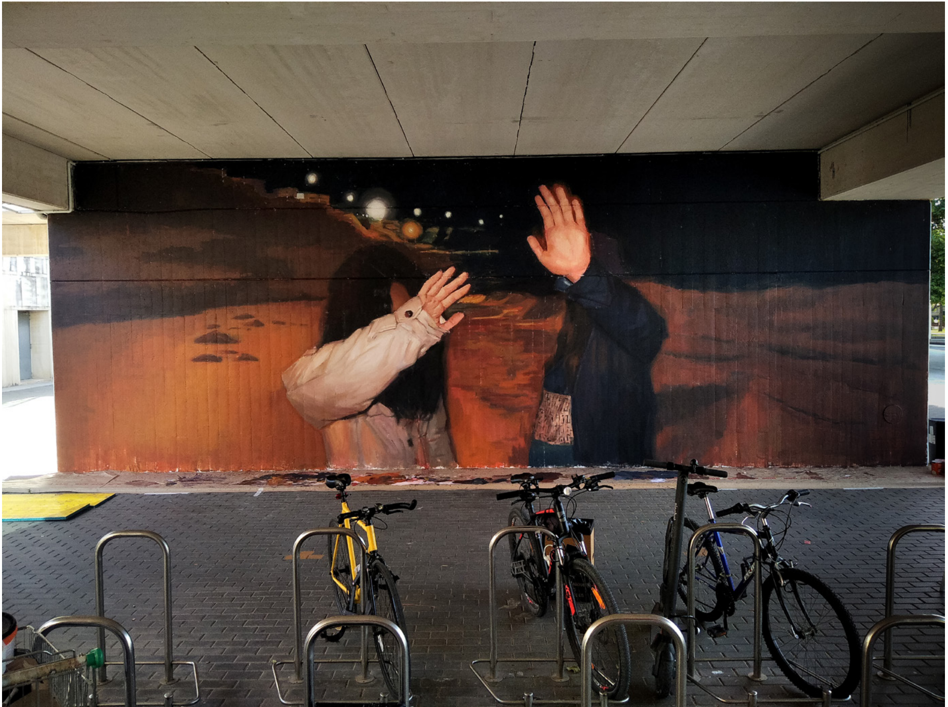
NOFLASH , Valencia, Spain, 2022.