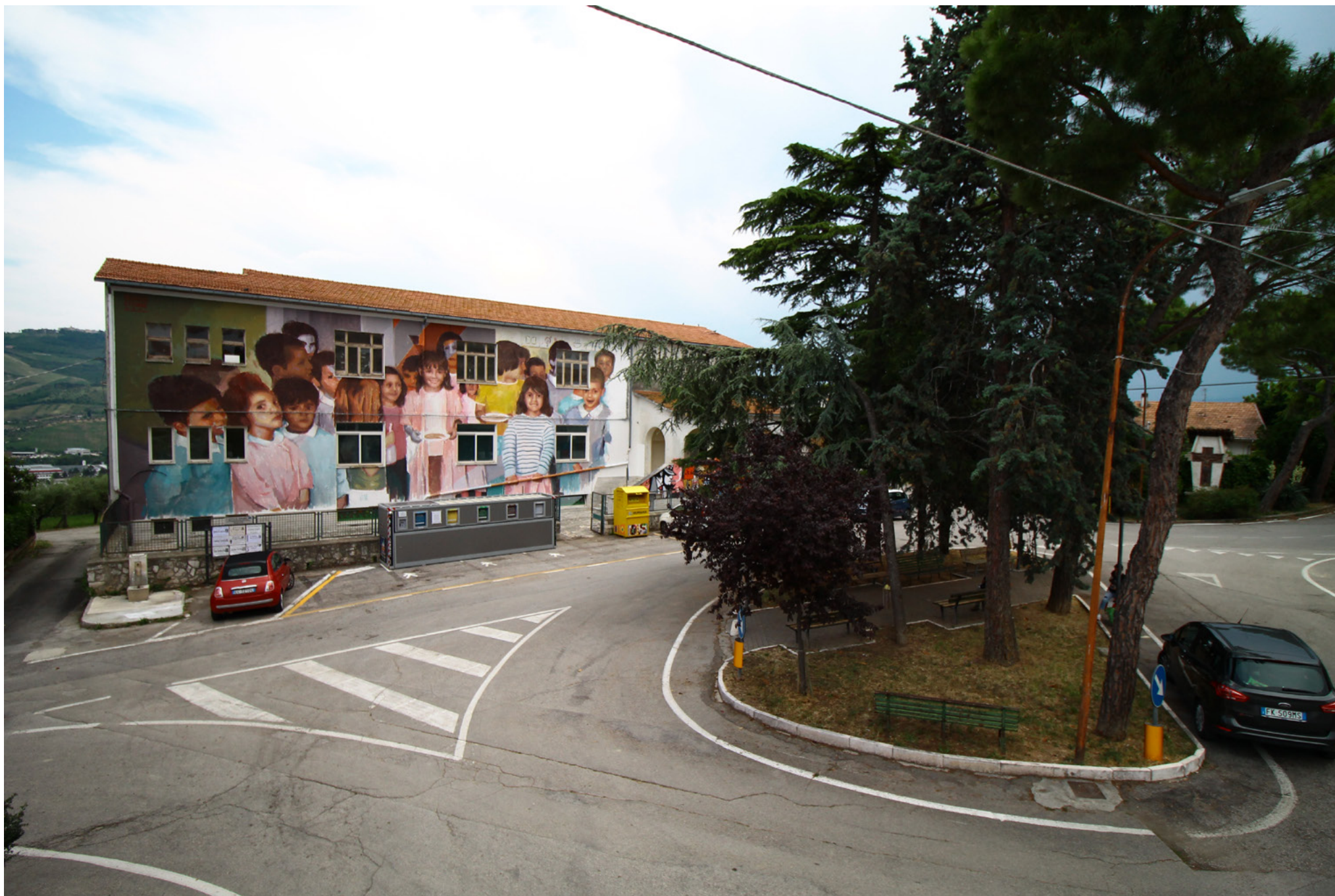
VIRTÙ , Teramo, Italy, 2021.