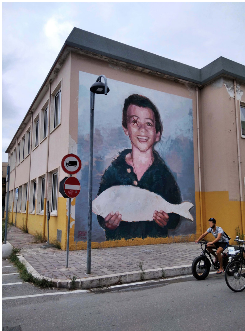
NON E' UN PROBLEMA MIO , Tortoreto (TE), Italy, 2021.