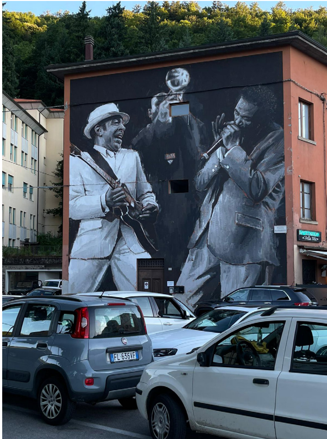
SOUL , Porretta Terme (BO), Italy, 2021.